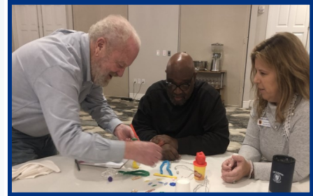
Above & Below: The Beaufort Board of Commissioners works together on a creative project during their Annual Retreat which was Jan. 30-31, 2024.

For more information on meeting dates and to view agendas visit www.beaufortnc.org/calendar .